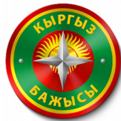
State Customs Service of the Kyrgyz Republic