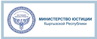
Ministry of Justice of the Kyrgyz Republic