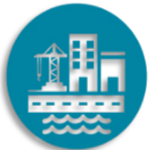
Trade, Tourism, & Economic Corridors Cluster