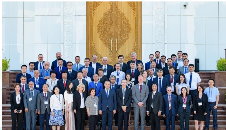
CAREC Trade cluster

https://www.carecprogram.org/?page_id=13249