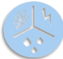
Agriculture & Water Cluster