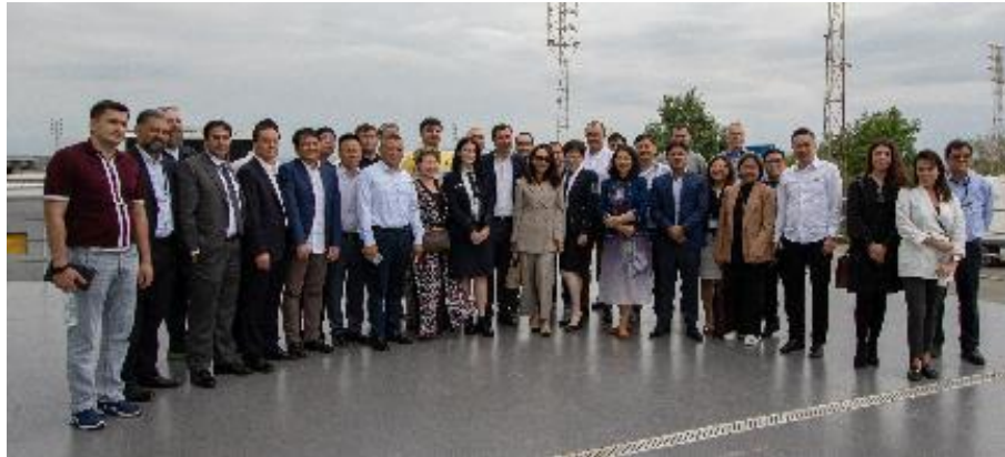
Site Visit to Tbilisi Clearance Zone, 10 June 2023