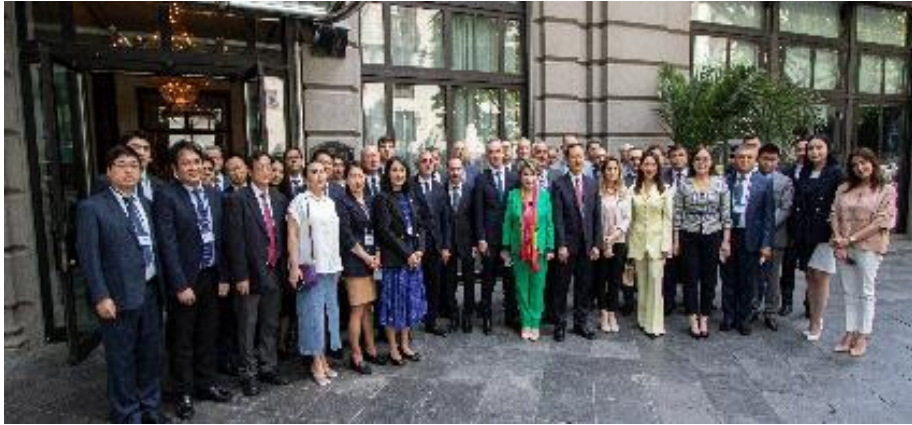
22 nd CAREC CCC Meeting, 9-10 June 2023