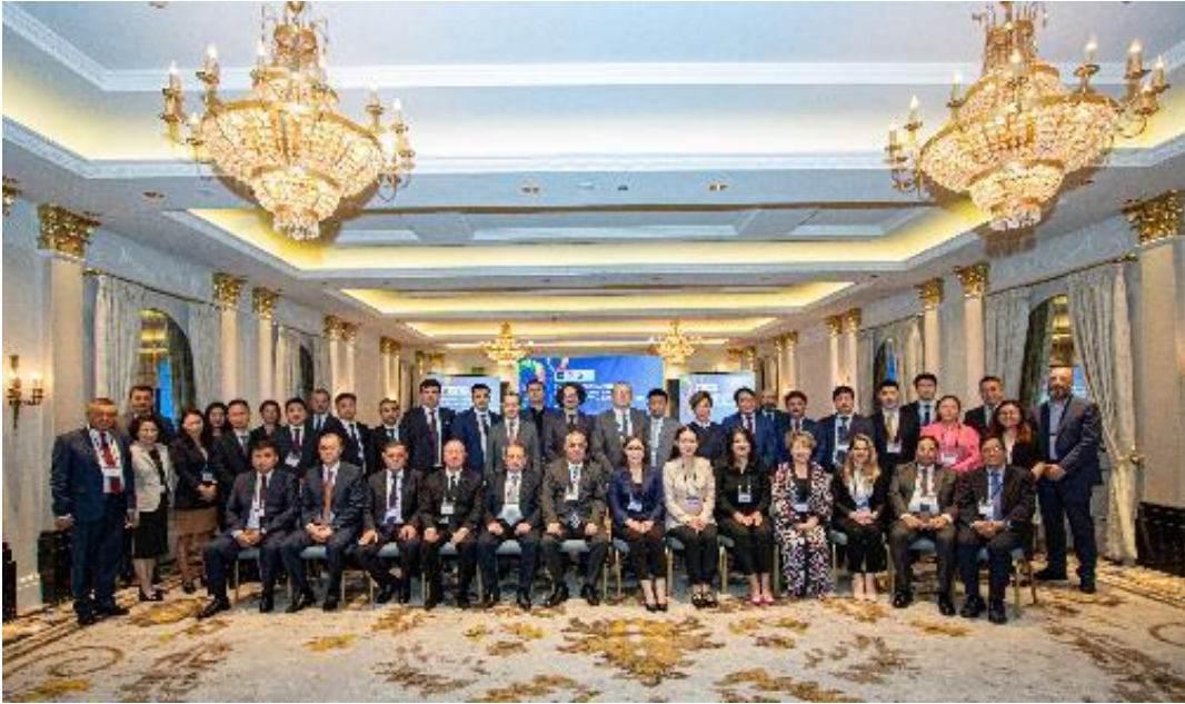
Knowledge-Sharing Event: Single Window for Digital Customs Cooperation in CAREC, 8 June 2023