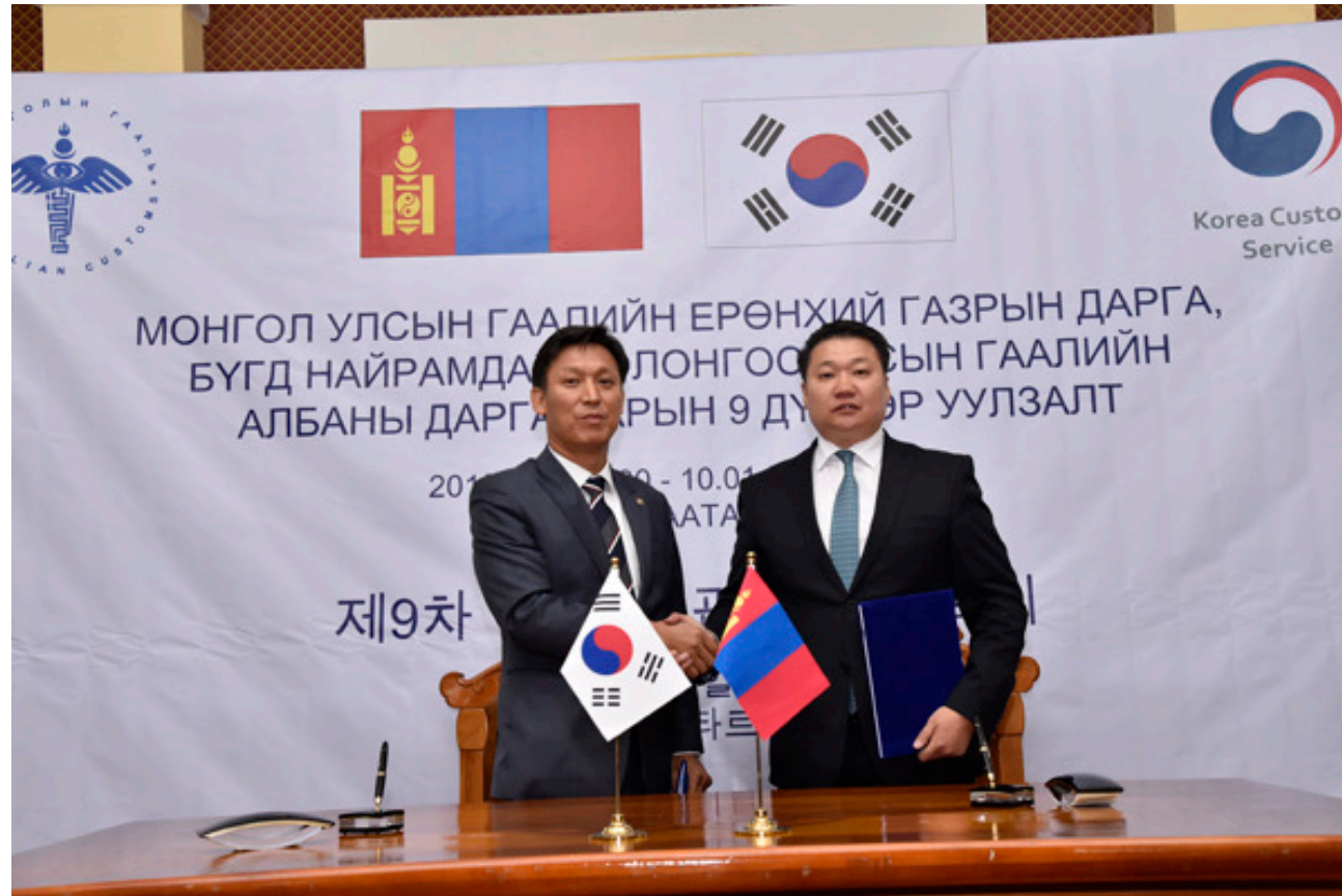
September 30 th 2019, signing of Mutual Recognition Arrangement (MRA) between China Customs and Mongolian Customs