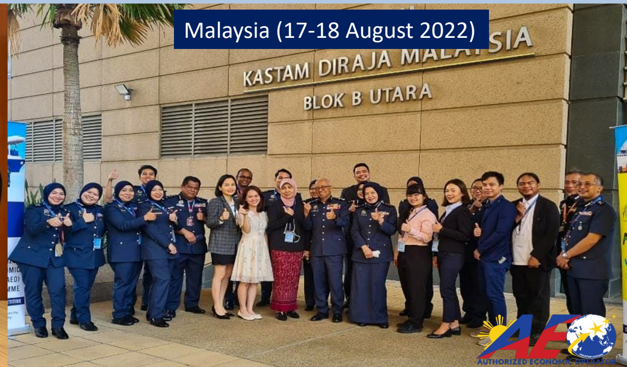
Malaysia (17-18 August 2022)