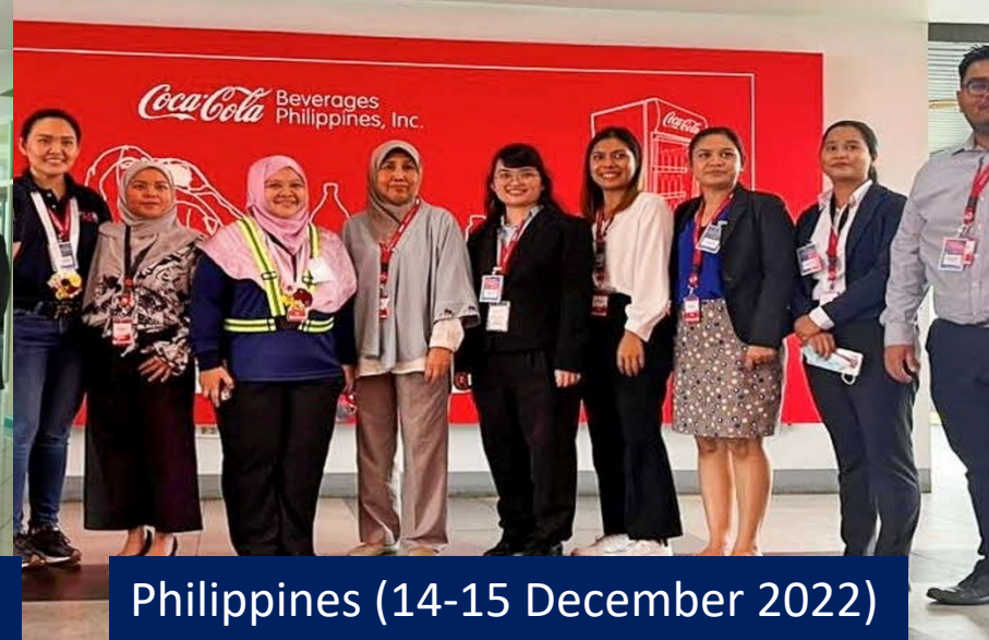
Philippines (14-15 December 2022)