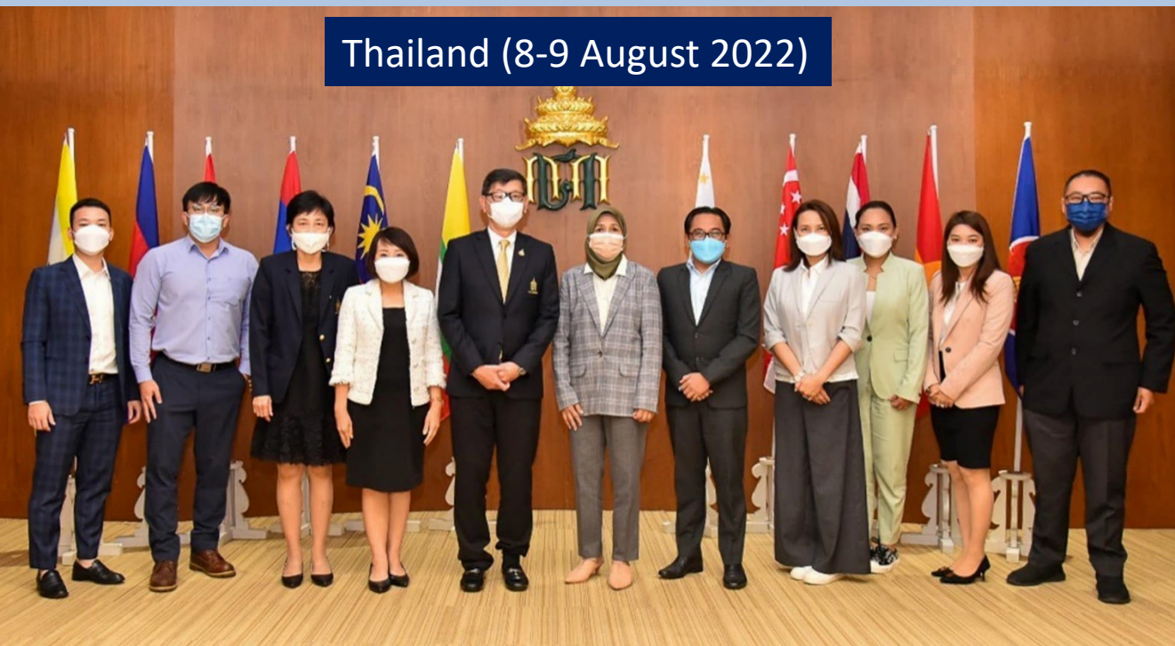
Thailand (8-9 August 2022)