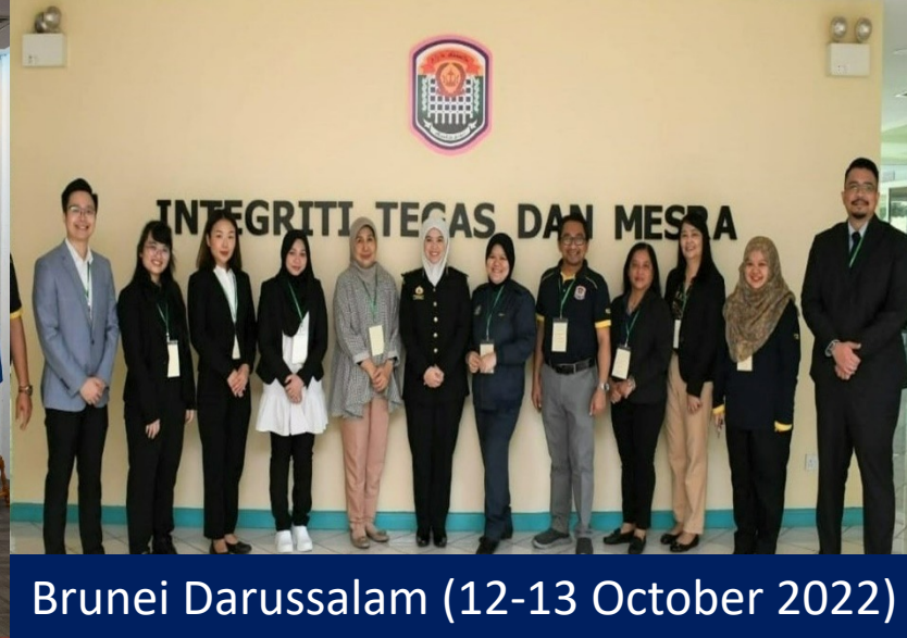
Brunei Darussalam (12-13 October 2022)