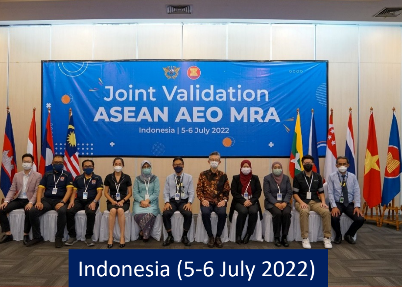
Indonesia (5-6 July 2022)