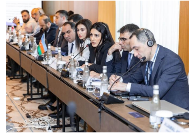
4 th Technical Working Group Meeting (15-16 April; Tashkent, Uzbekistan)