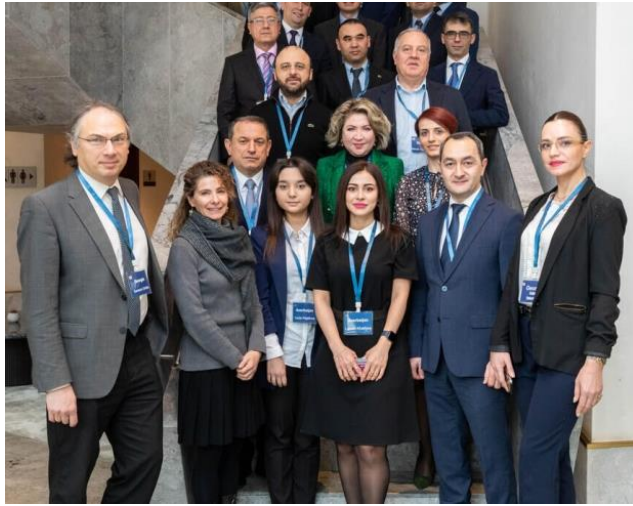
3rd Technical Working Group Meeting (5-6 February; Tbilisi, Georgia)