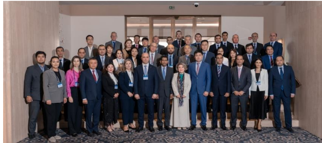
23 rd CAREC Customs Cooperation Committee Meeting (15-16 August; Astana, Kazakhstan) - "The CCC welcomed the progress made in implementing the testing phase of the prototype. The participating countries expressed their support for continuing the testing phase of the system concepts and design to streamline regional customs transit procedures and potentially increase intra-regional trade."