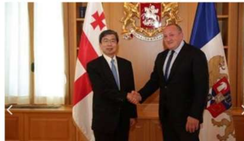
ADB President visits Georgia, reaffirms commitment to expand partnership

CAREC Workshop On Trade And Trade Facilitation Reforms—WTO Trade Facilitation Agreement And Consolidated Trade Agenda