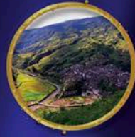
Waipula Village, Yunnan PEOPLE'S REPUBLIC OF CHINA