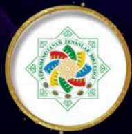
Central Council of the Women's Union of Turkmenistan TURKMENISTAN