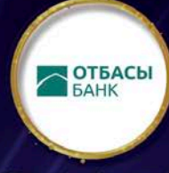
JSC Housing Construction Savings Bank "Otbasy Bank" KAZAKHSTAN