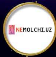
"Nemolchi" Media Project UZBEKISTAN