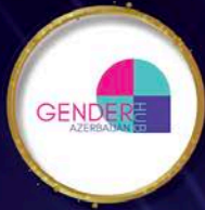
Gender Hub Azerbaijan AZERBAIJAN