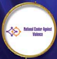
National Center Against Violence MONGOLIA