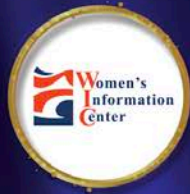
Women's Information Center GEORGIA