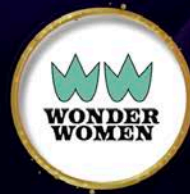
Wonder Women REGIONAL ORGANIZATION