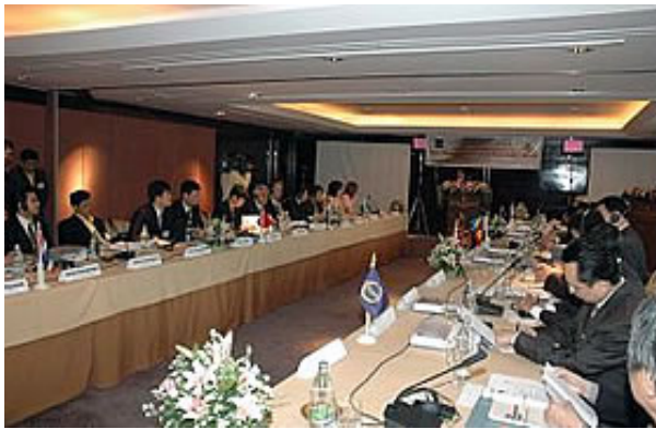
This seminar is the second regional event sponsored by the Royal Thai Customs for CAREC's Trade Facilitation Program