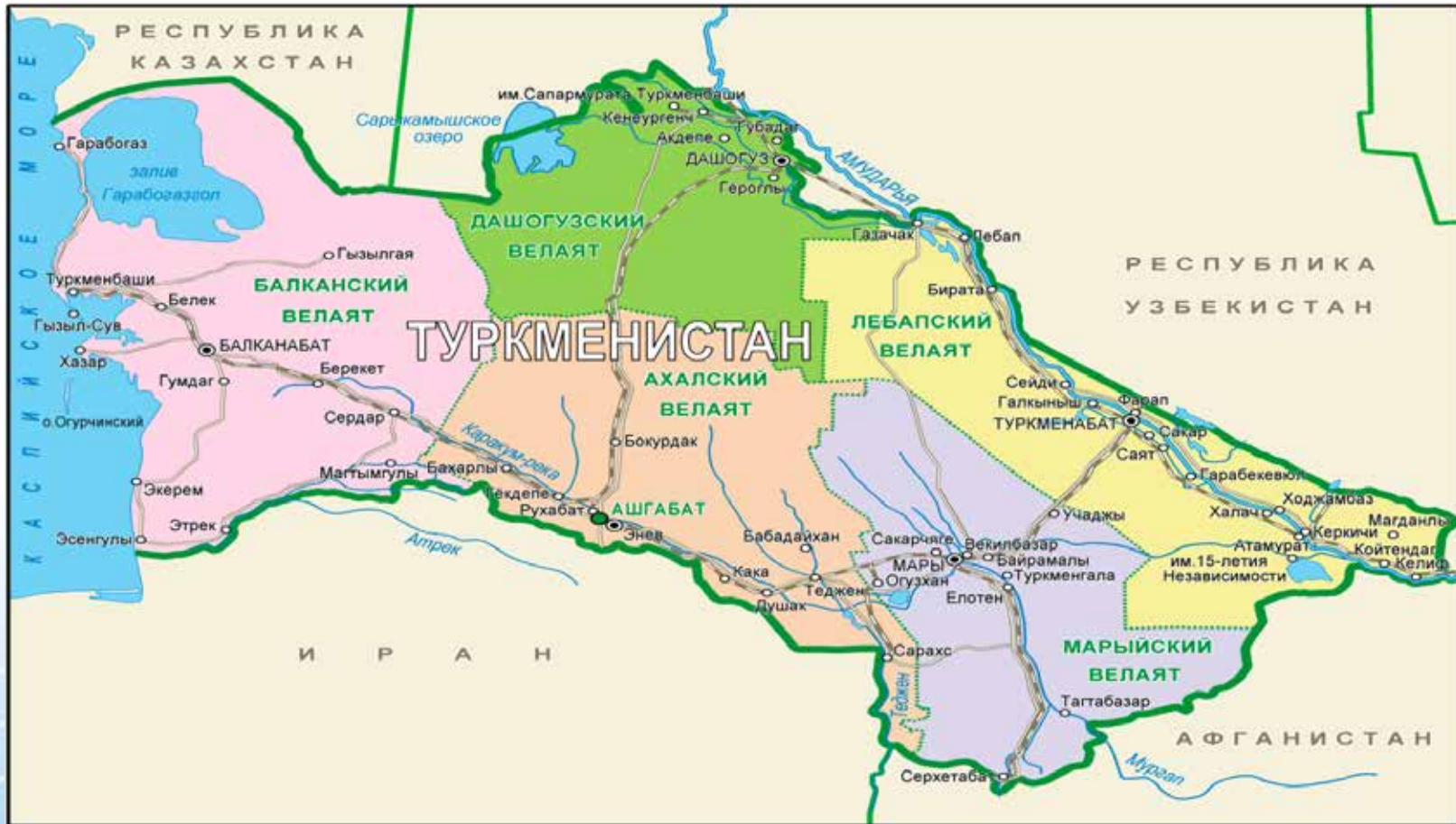
Map of routes linking Turkmenistan to neighbors