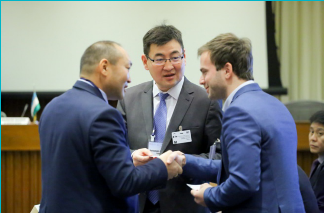
CAREC Railway Working Group Meeting 12-13 December 2019, Bangkok