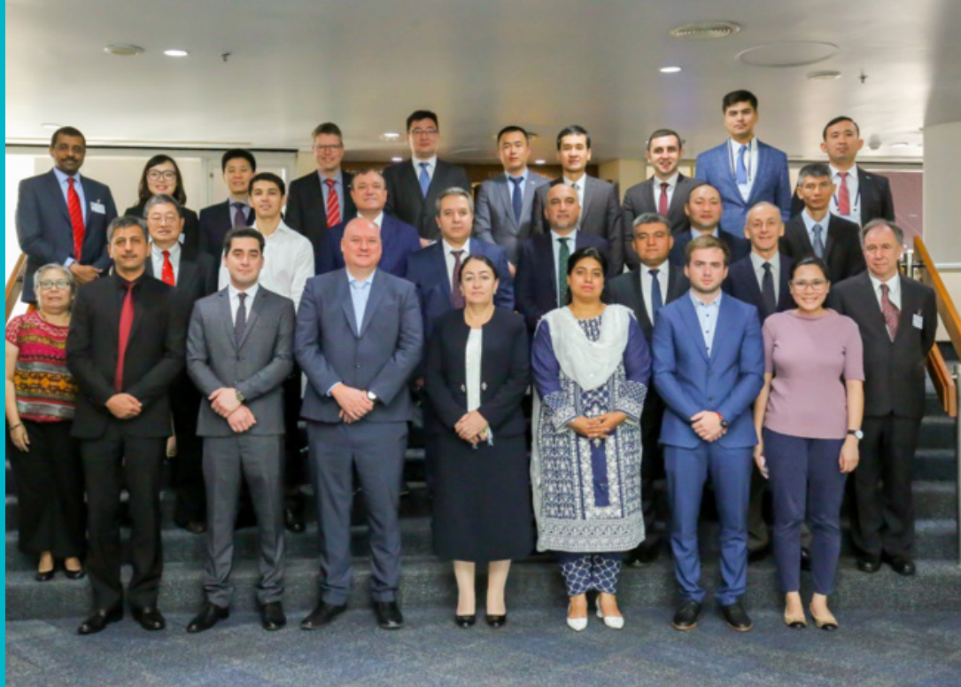
CAREC Railway Working Group Meeting 12–13 December 2019, Bangkok