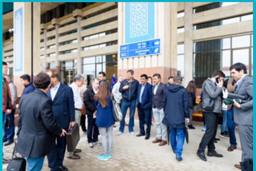
High-speed train travel Tashkent-Samarkand, 22 April 2019