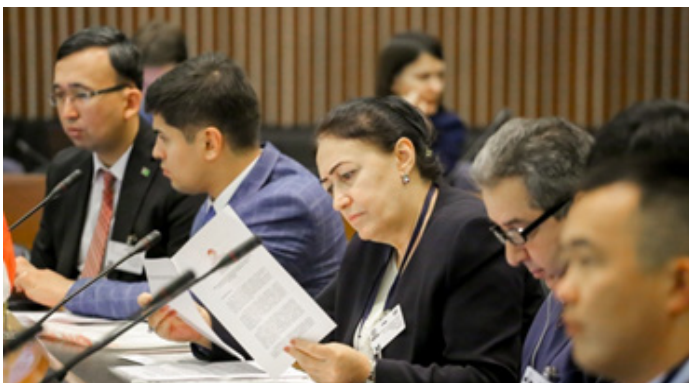
CAREC Railway Working Group Meeting 12-13 December 2019, Bangkok.

As agreed at the fifth CAREC RWG meeting in Bangkok on 12 and 13 December 2019, the TA would deliver an explanatory note on the use of railway capacity software. On 1 May 2020, a report on track capacity and timetabling software was published at the CAREC website. 3 This publication was due to be shared with RWG members at the sixth RWG meeting in March that was postponed, in combination with a dedicated session on functions and practical use of track capacity and timetable software, including demonstrations. This initiative will be followed up at the next plenary meeting of the RWG.