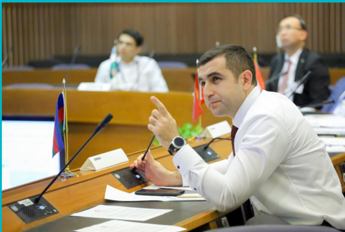
CAREC Railway Working Group meeting 12-13 December 2019, Bangkok

While the COVID-19 pandemic has delayed implementation of some activities of the technical assistance project and required postponement of the CAREC RWG meetings, there are reasons for optimism.