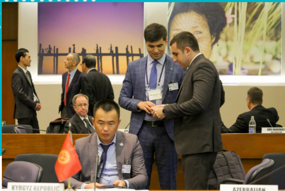
CAREC Railway Working Group Meeting 12–13 December 2019, Bangkok