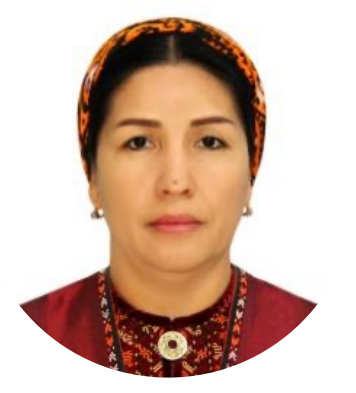
Deputy Director for Science and Technology Centre of Technologies of the Academy of Sciences