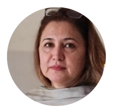
Additional Secretary Ministry of IT and Telecommunication of Pakistan