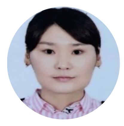
Specialist National Data Center