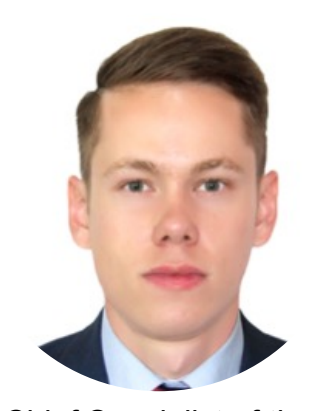
Chief Specialist of the Tariff and Non-Tariff Regulatory Measures Department Ministry of Investments and Foreign Trade