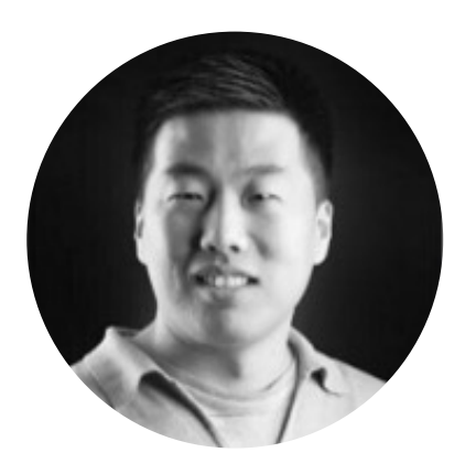
Co-Founder and CEO Erxes Inc