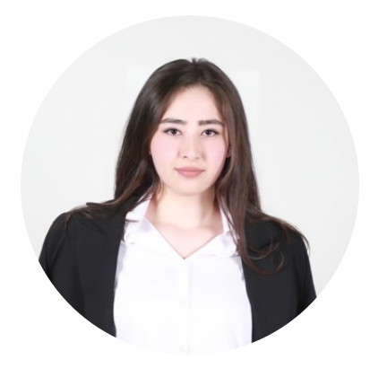
Head for Venture Capital Department of FiftyFive Group, Managing Director in Tajikistan Venture Capital