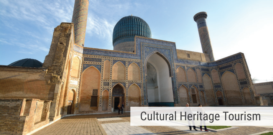
Cultural Heritage Tourism