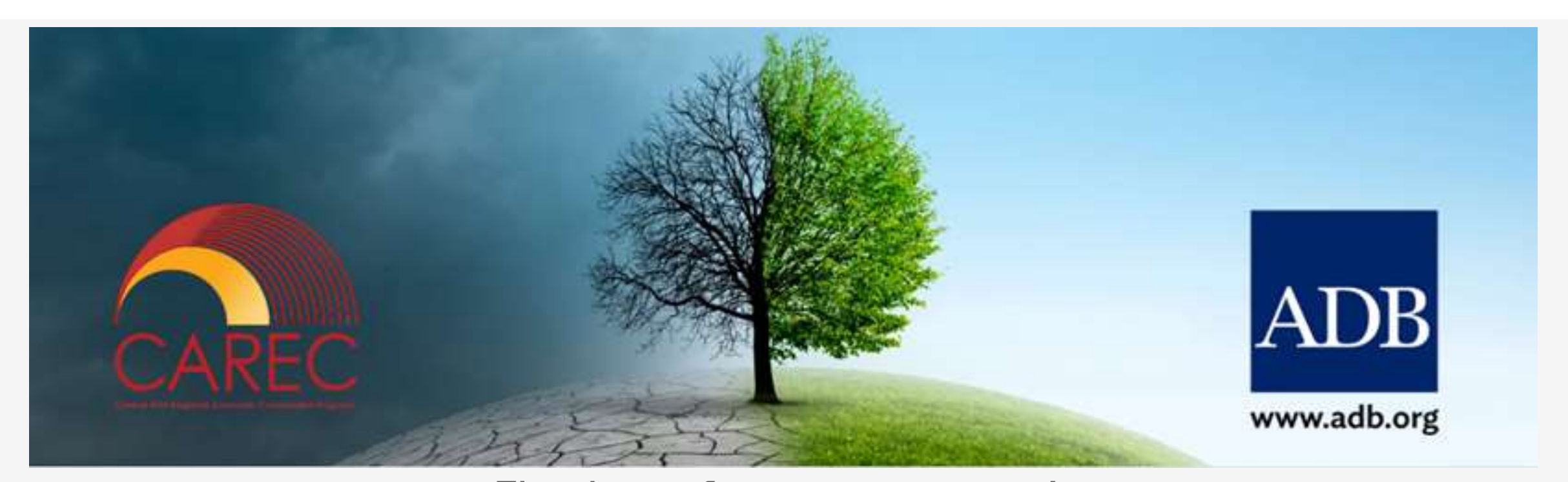
Thank you for your attention!