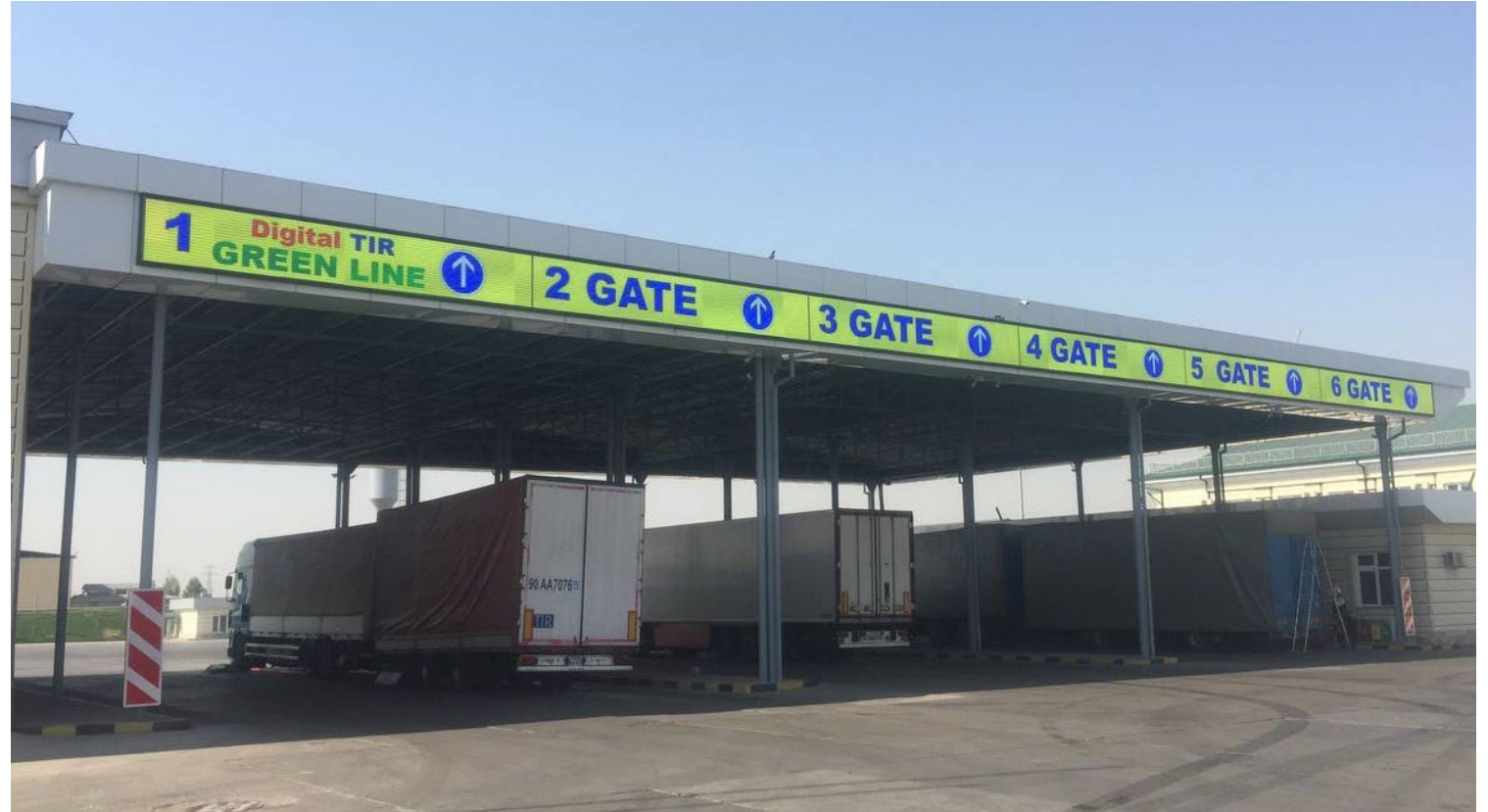
Konysbaeva – Yallama (TIR-EPD Green Lanes)