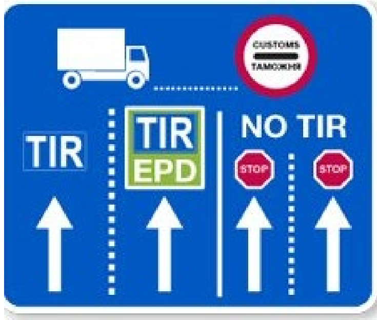
TIR-EPD green lanes at 10 BCPs in Turkmenistan (April 2023)