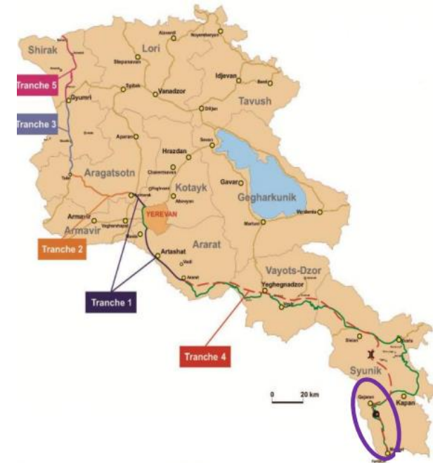
North-South road section (Phase 4) financed with the EFSD IL