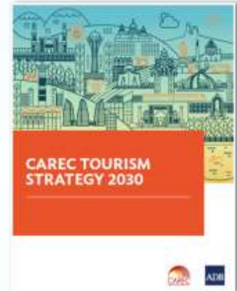
CAREC Tourism Strategy 2030