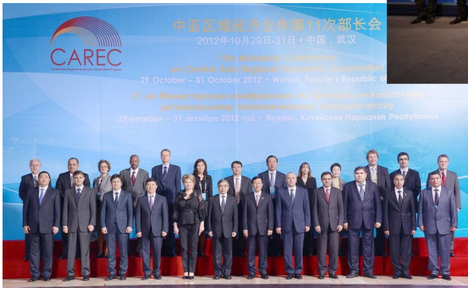
11 th Ministerial Conference, Wuhan, People's Republic of China