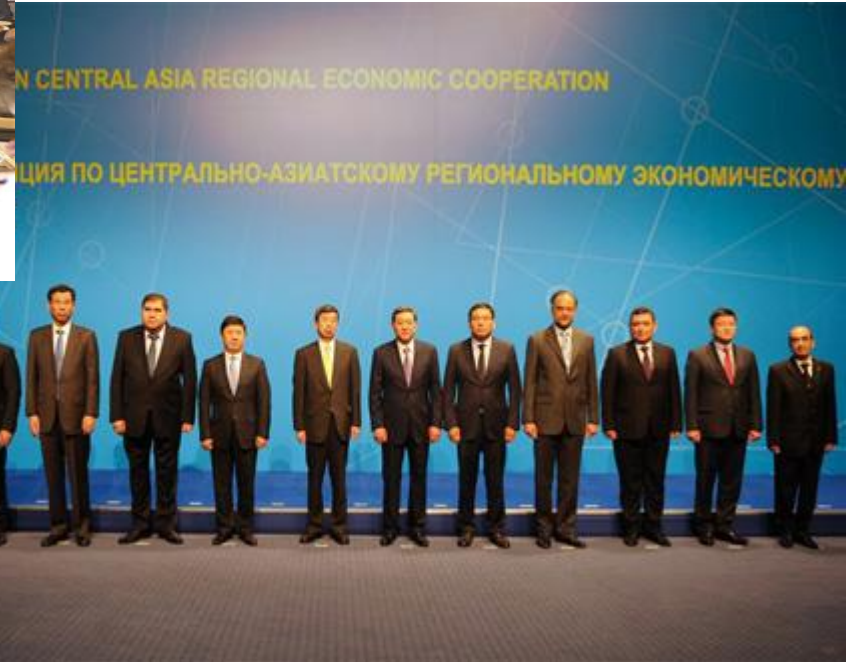
12 th Ministerial Conference, Astana, Kazakhstan