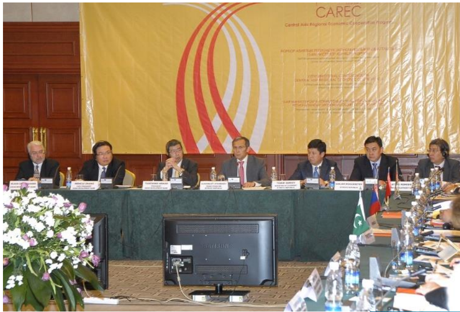
13 th Ministerial Conference, Bishkek, Kyrgyz Republic