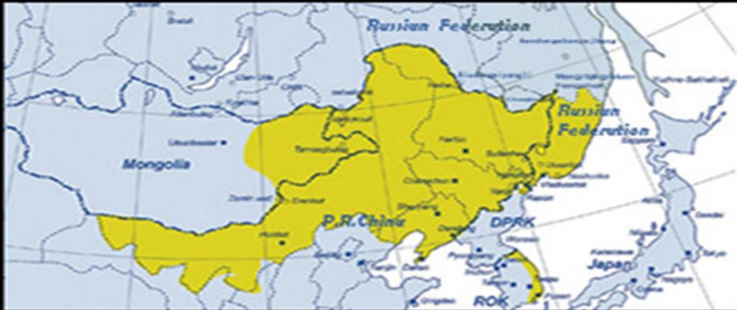
The Greater Tumen Region