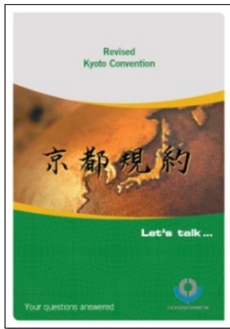
RKC SA E-1 (Customs transit)