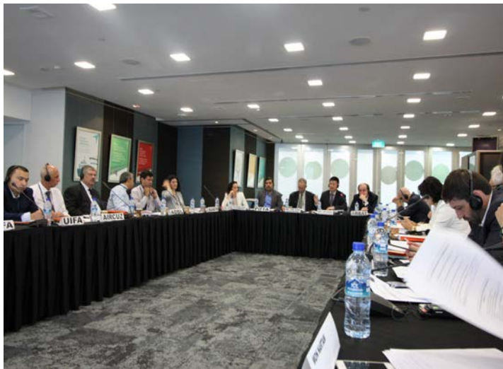
Inaugural Meeting of the CAREC Regional Trade Group 25-26 June 2018 ,Bangkok, Thailand