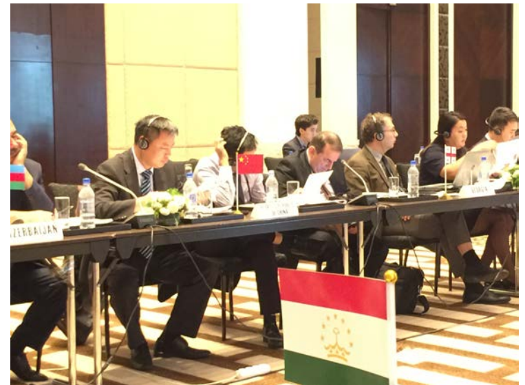
Inaugural Meeting of the CAREC Regional Trade Group 25-26 June 2018 ,Bangkok, Thailand