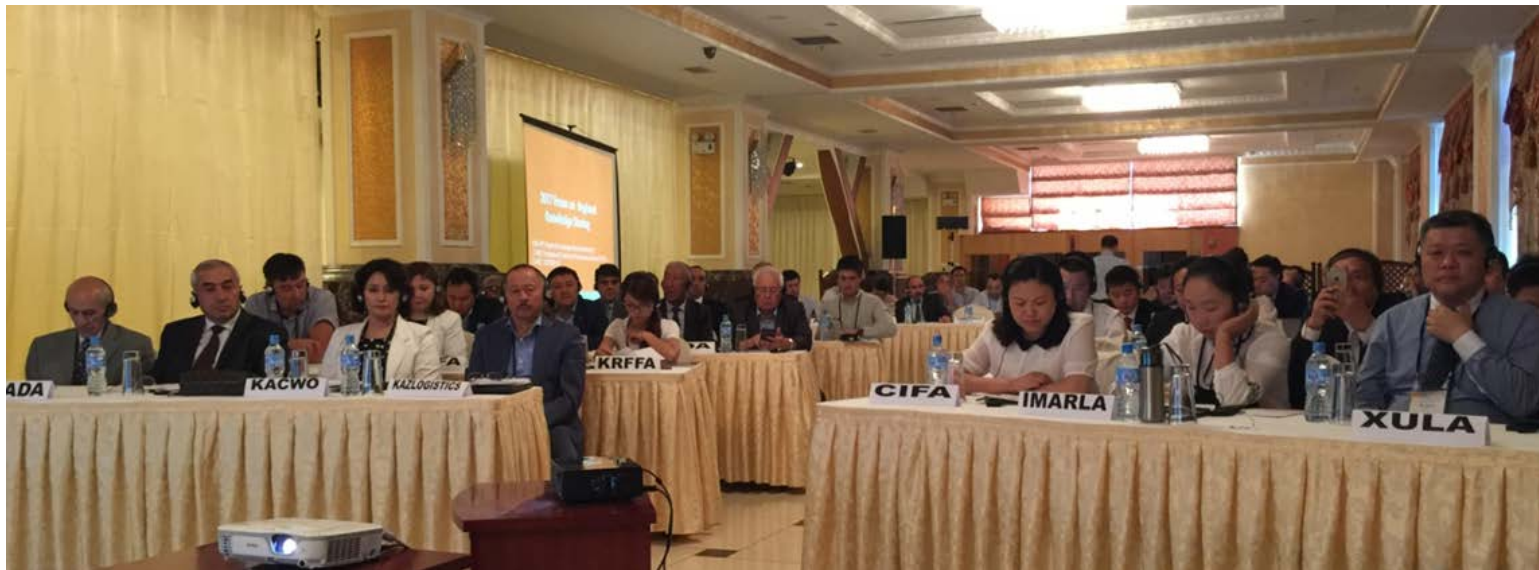
Inaugural Meeting of the CAREC Regional Trade Group 25-26 June 2018, Bangkok, Thailand

On August 15-18, 2017, ten CFCFA standards (in Chinese, English and Russian versions) review meeting, and 2017 Forum for International Regional Knowledge Sharing were held in Tashkent. ten standards were adopted by international experts and CFCFA members after review and examination of regulation compliance and conformity with international practice. These standards were updated to the international level.