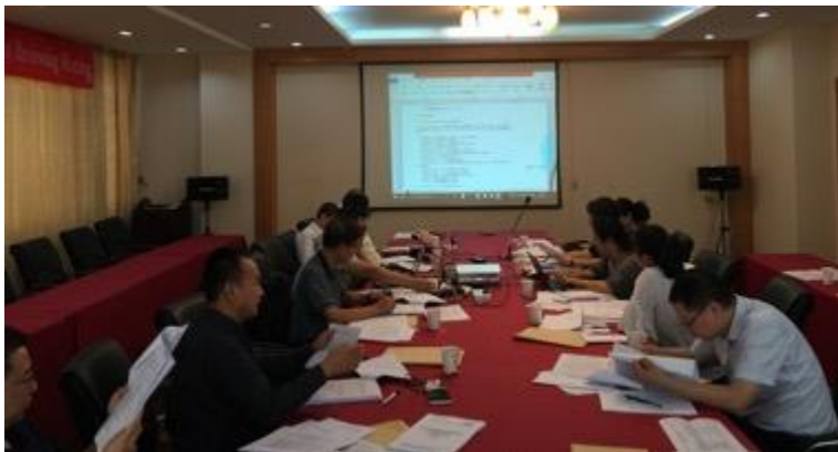
9th CFCFA Annual meeting 4 September 2018 Ashkhabad , Turkmenistan