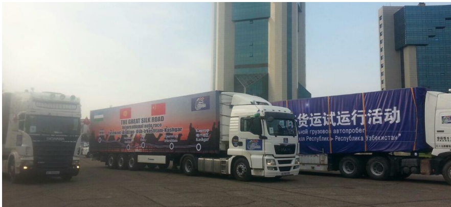
9th CFCFA 9th CFCFA Annual meeting 4 September 2018 Ashkhabad , Turkmenistan

The Freight Forwarders Association of Uzbekistan participated in the launching of the pilot project on the international road transport among PRC, KYZ and UZB. It worked together with Shenzhen Hyun Young International freight company, Kashi Jin Leader and coordinated with local government agencies and railway companies to launch the Andijan-Osh-Kashi-Shenzhen public rail transport routes.