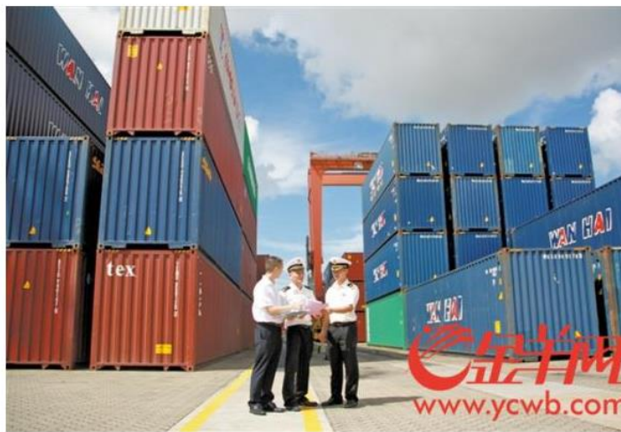
海关关员现场查验