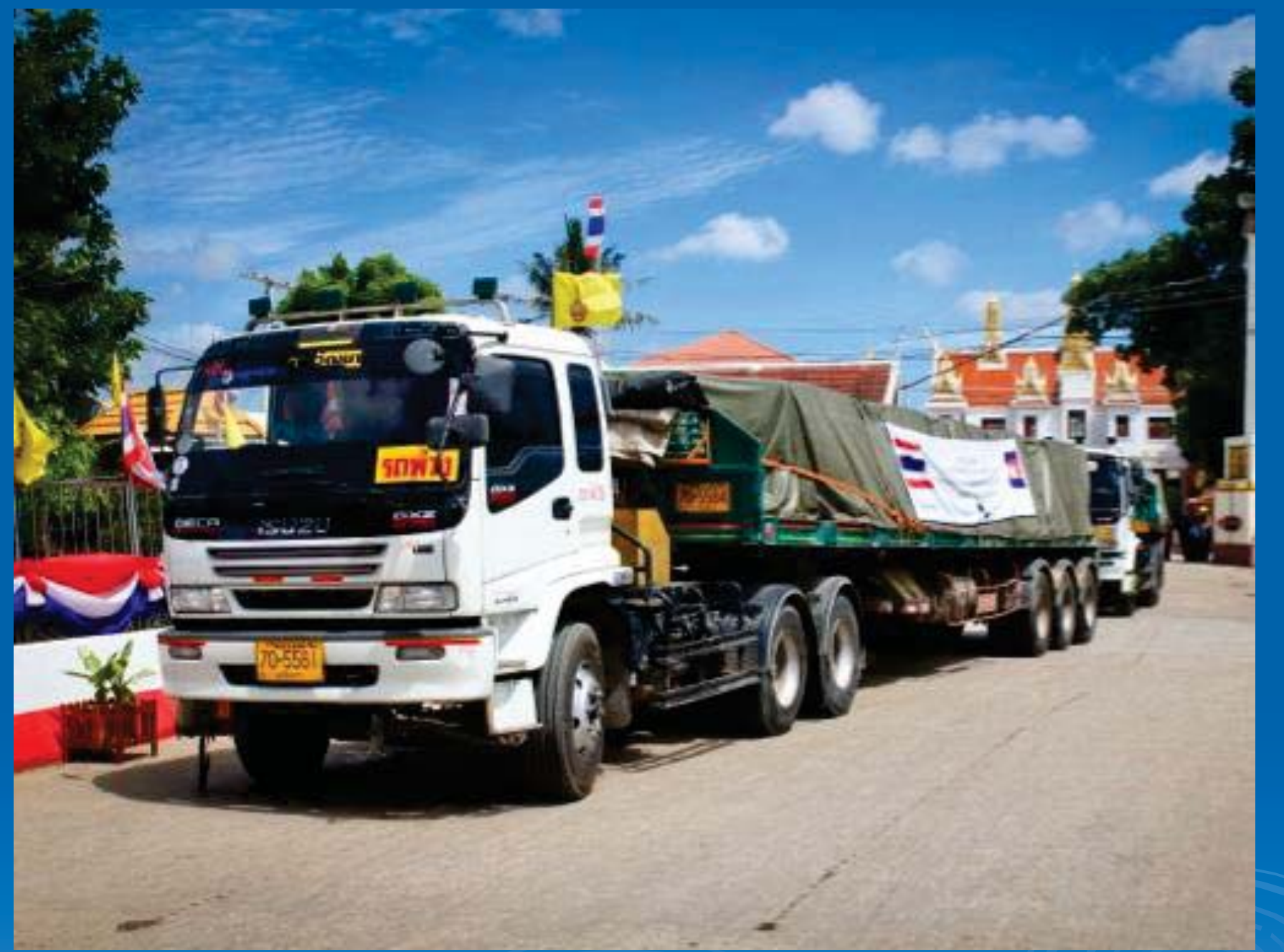
Cargo trucks from Bangkok, Thailand crossing the Aranyaprathet-Poipet border bridge.