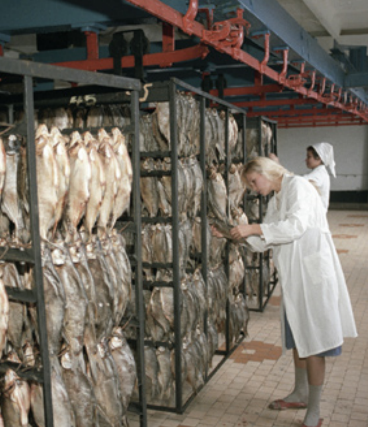
Central Asia Fish Trade, 1996 and 2006, $ '000