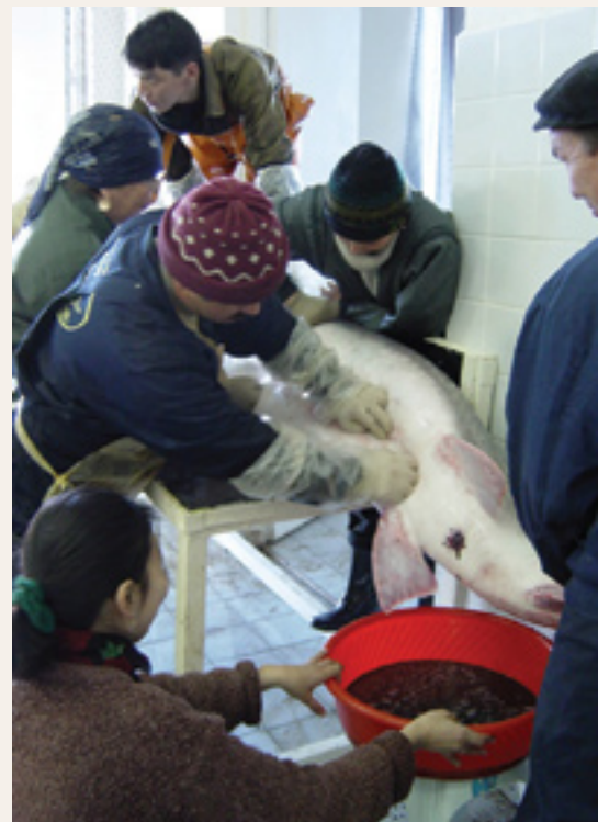
Upper: In the past decade, fishers have rarely seen mid-sized Beluga sturgeon like the one pictured here, captured from the Volga River in the Russian Federation. Lower: A Beluga sturgeon from Kazakhstan's Ural River undergoes a nonlethal method of egg extraction.