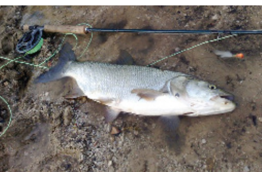
Top left: Fresh fish for sale in a street in Almaty, Kazakhstan. Top middle: People fishing at a trout farm in Turgen Gorge near Almaty. Top right: Fish being prepared for canning at a factory in Turkmenbashi on the Caspian Sea, Turkmenistan. Middle: Dried fish for sale at a roadside store near Naryn, Kyrgyz Republic. Bottom: The asp ( Aspius aspius ) is a fish-eating carp, found in most of Asia and eastern Europe; it grows to 9 kilograms and is a game fish as well as a commercial species in Central Asia.

disappeared. In 2003, a Fish Farming Committee was established to revive the industry. Hatcheries for carp and sturgeon are being set up and long-term land leases made available to encourage private investment.